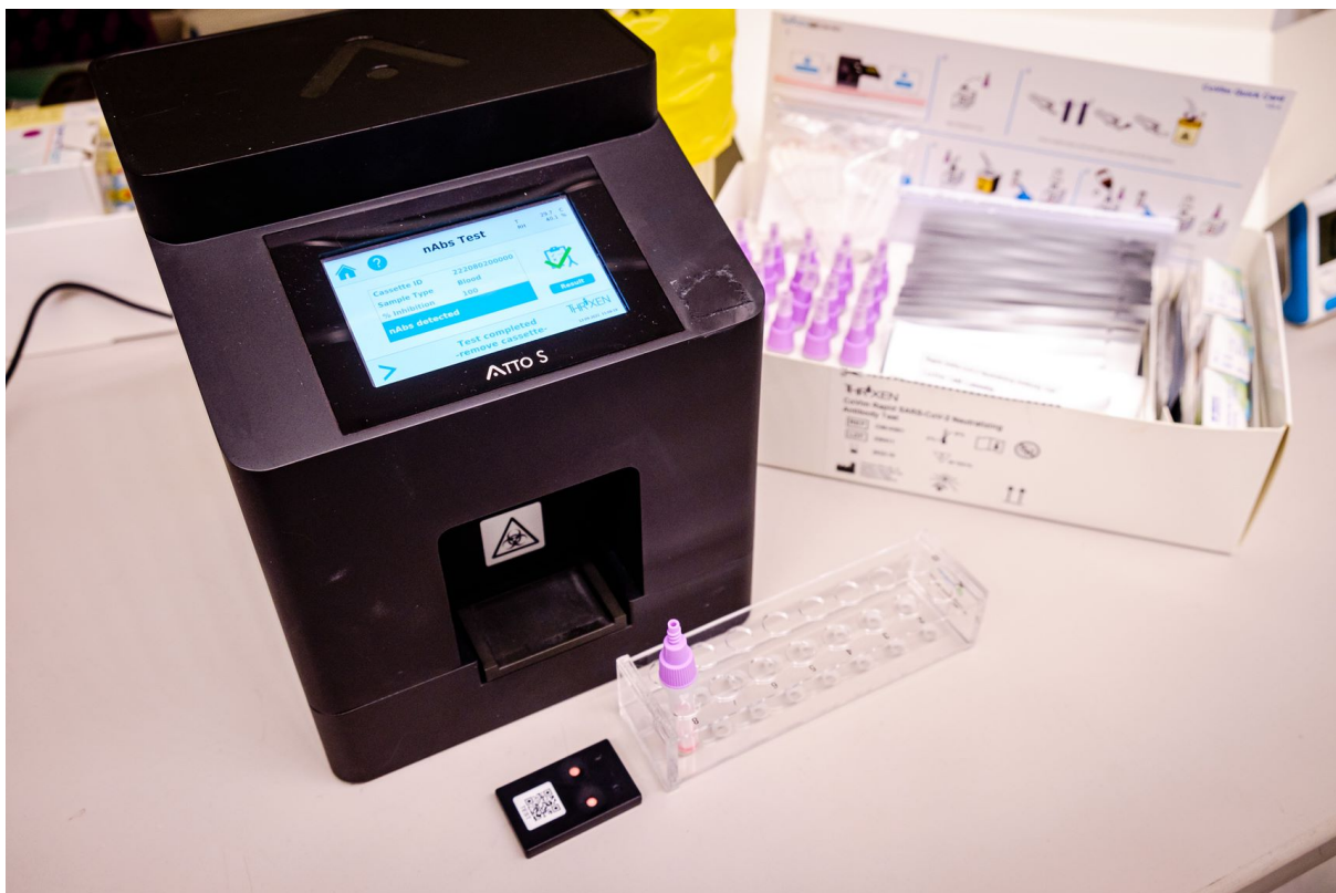
COVID-19 antibodies test kits (right) and the digital reader device (left in black), which can detect levels of COVID-19 antibodies from a drop of blood in just ten minutes.

With a drop of finger prick blood, the test kit can evaluate an individual's neutralising antibody level against a specific COVID-19 variant within 10 minutes, making this an efficient, low-cost, and easy-to-use tool that will enable large-scale testing and can be widely deployed anywhere as part of a personalised vaccination strategy.